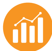
Reporting and Reconciliation

"The introduction of OneStopSecure as our commerce platform ensures a simpler and easier experience for the customer, and a more refined and streamlined process for the Shire staff to receive payments and perform refunds. Application completion times across many of the units have been reduced – one team is estimated to save 50-60 hours a week thanks to the OneStopSecure digitised forms. Our customers are also responding in a much shorter time."