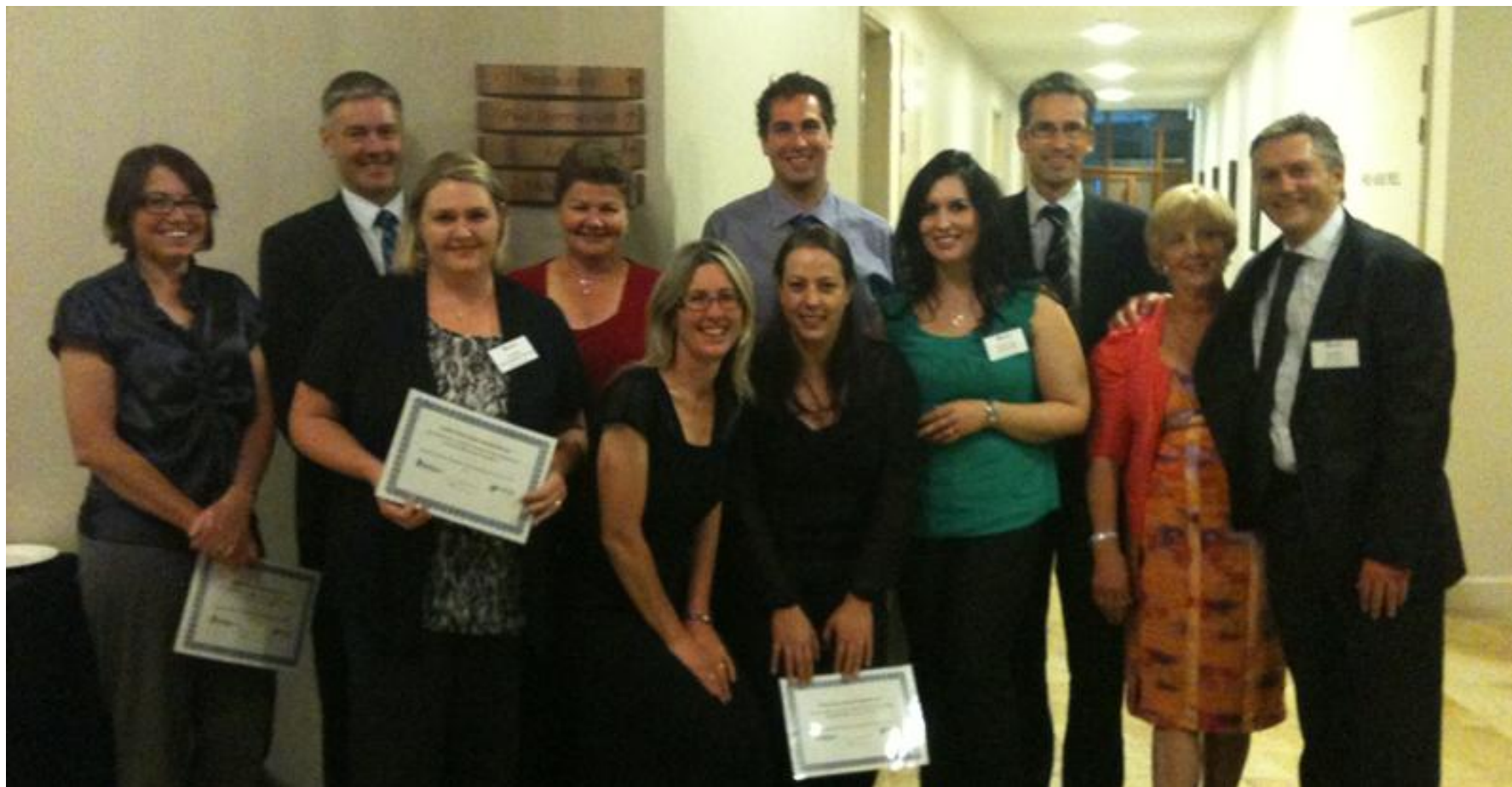
Participants announced at FinPro Conference